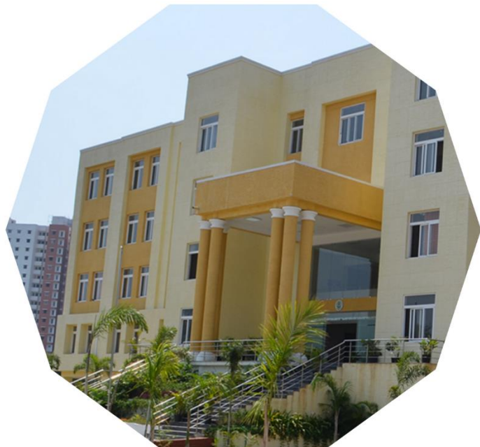
IFPGS - Chennai