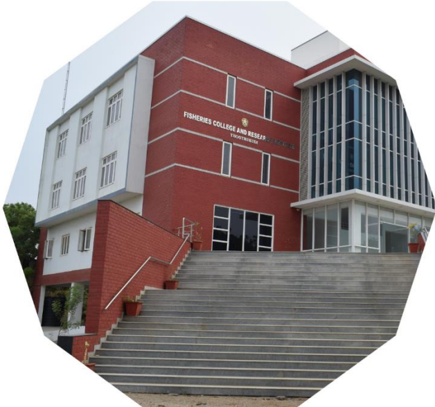
FCRI - Thoothukudi