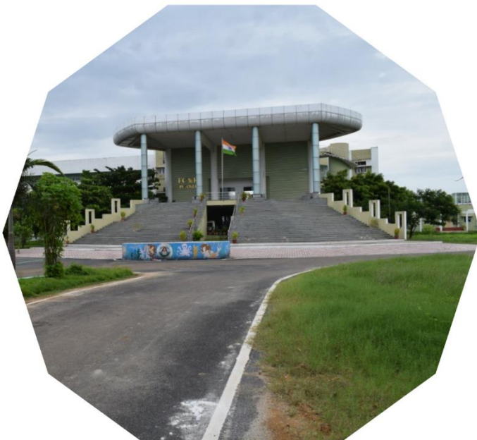
Dr. MGR FCRI - Ponneri