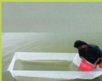
Fry stocking in hapa

Brooders (Total 25 Nos.) of average weight 102 g were selected and injected with HCG @1500 IU/Kg of fish at intraperitoneal region. For substrate and hideouts, flower pots and PVC pipes were placed in the ponds of 80 sq.m. Five sets of breeding was observed in pond. Eggs were found attached in flower pot. More than 1500 hatchlings were observed from single pair. 2000 Nos. of fry (1-2cm size) were collected and stocked in hapas for rearing.