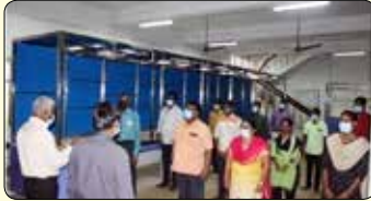
College of Fisheries Nautical Technology, Thoothukudi