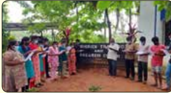
Kanniyakumari, Parakkai CeSA, TNJFU