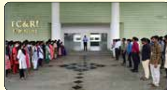
M.G.R. Fisheries College & Research Institute, Ponneri