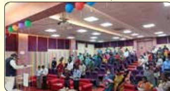
Institute of Fisheries Post Graduate Studies, Vaniyanchavadi, Chennai