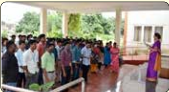
College of Fish Nutrition and Food Technology, TNJFU campus, Madhavaram Chennai