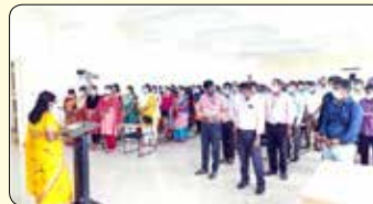
Dr. MGR. Fisheries College & Research Institute, Thalainayeru