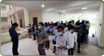
Directorate of Incubation & Vocational training in Aquaculture, (DIVA – TNJFU) Muttukadu, Chennai