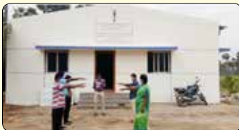
Kanniyakumari – Ganapathipuram CeSA, TNJFU