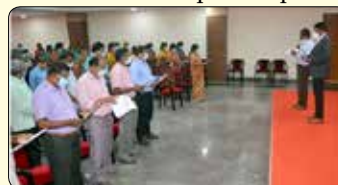
Tamil Nadu Dr. J. Jayalalithaa Fisheries University, Nagapattinam

Tamil Nadu Dr. J. Jayalalithaa Fisheries University, has celebrated “Constitution Day” on 26 th November 2021 to commemorate the adoption of the constitution of India and pay tribute to the invaluable contribution of Baba Saheb Dr.Bhimarao Ambedkar and other founding fathers of the constitution. As part of the celebration of Constitution Day, Tamil Nadu Dr.J. Jayalalithaa Fisheries University and its constituent units, Colleges and Institutes have organized Preamble reading, special talk on “Constitutional values and fundamental principles of Indian constitutions”, Quiz programmes, Essay writing, drawing competitions, Mock Parliament and special speech by the students.