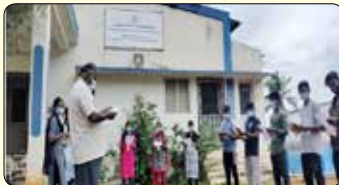
M.G.R. Fisheries College & Research Institute, Ponneri