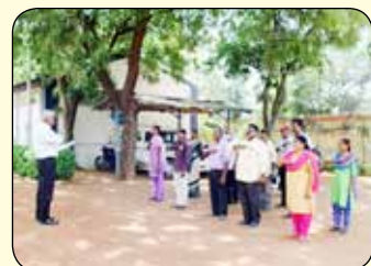
College of Fisheries Nautical Technology, Thoothukudi