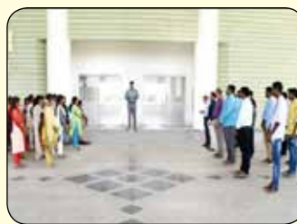
Dr. MGR Fisheries College & Research Institute, Ponneri