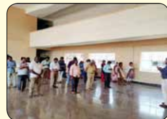
College of Fisheries Engineering, Nagapattinam