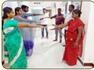
KKP, Parakkai CeSA