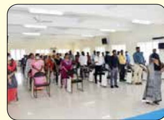
Dr. MGR Fisheries College & Research Institute, Thalainayeru