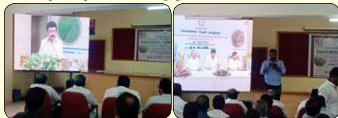
Video Conferencing of Hon'ble CM inaugural address