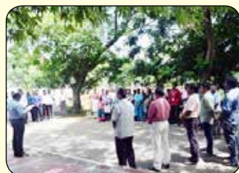
Fisheries College & Research Institute, Thoothukudi