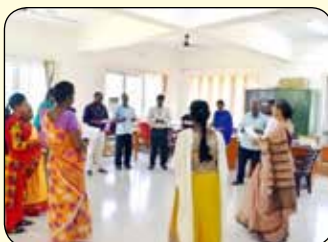
College of Fish Nutrition & Food Technology, Madhavaram