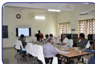
Dr.MGR FCRI, Thalainayeru