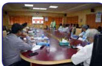
Dr.MGR FCRI, Ponneri